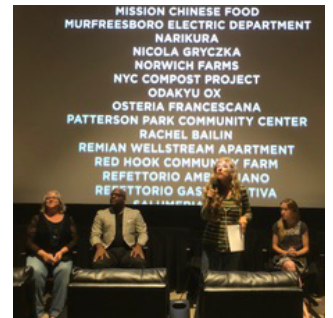
Panel discussion at the film "Wasted – The Story of Food Waste," opening weekend Santa Monica, October 2017

Recommended links for further information and research