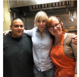
Dinner at the Grandview Foundation