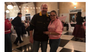
CCOTC 50's Fundraiser Gala