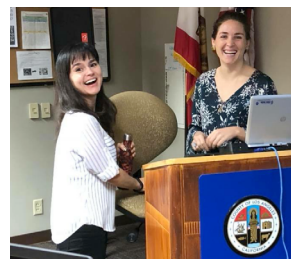
LA County LACFRI Food Recovery training in Los Angeles

Los Angeles Environmental Health Department conducted a Food Recovery informational training session for more than 500 health and food safety inspectors in L.A. County through LACFRI (L.A. County Food Recovery Initiative). "It's okay to donate food" was the game-changing message for inspectors to carry back to their L.A. County food businesses.